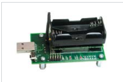
MIB520CB with attached Mote